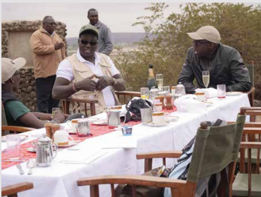
Bush breakfast catch up