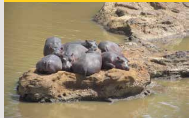
The taste of Kenya