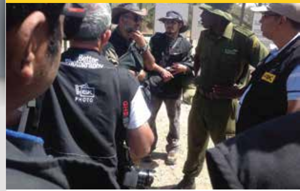
Eland - the beauty!