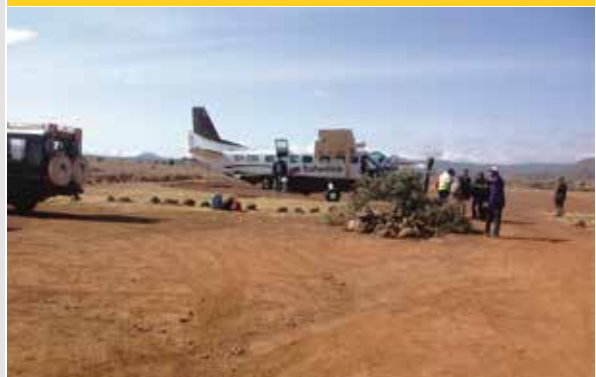
Quick connections - LEWA Conservancy Airstrip