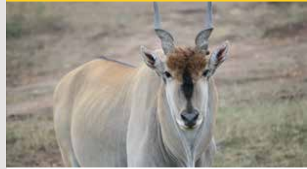
Hippos basking in the Mara River