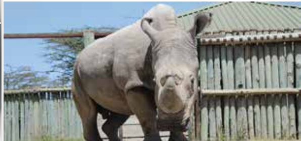
Sudan - The only remaining Northern White Rhino