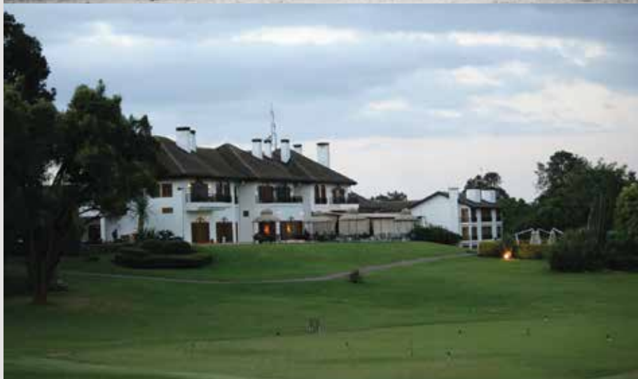
The Magnificent Fairmont Mount Kenya Safari Club