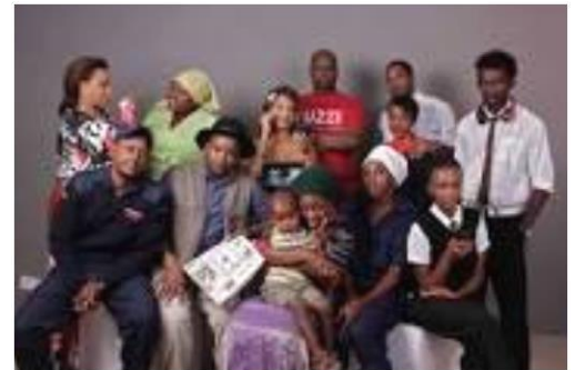
Best foot forward