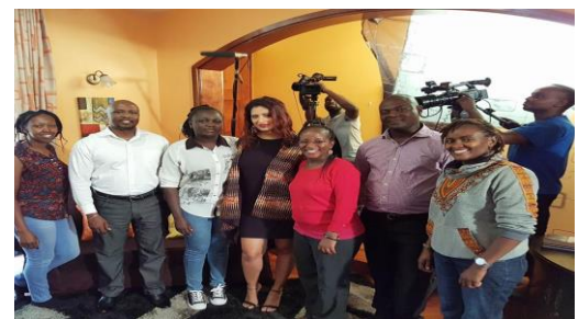
Courtesy call by KFC team