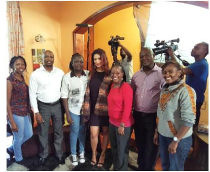
Crew in action